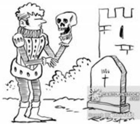
"Some might say I've taken Method acting too far."