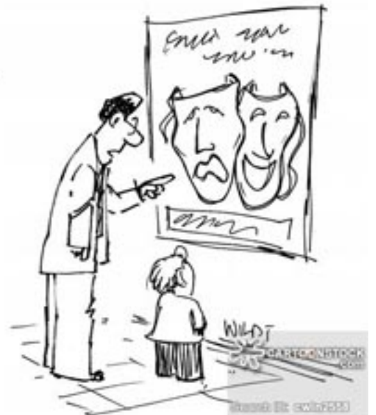
"The classic masks of Comedy and Tragedy, or as they're now known, emoticons."