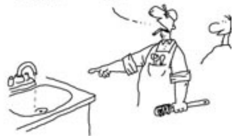
IMPORTANCE OF A BIT OF THEATRE IN PLUMBING