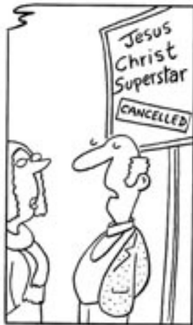
"We'll resurrect it later."